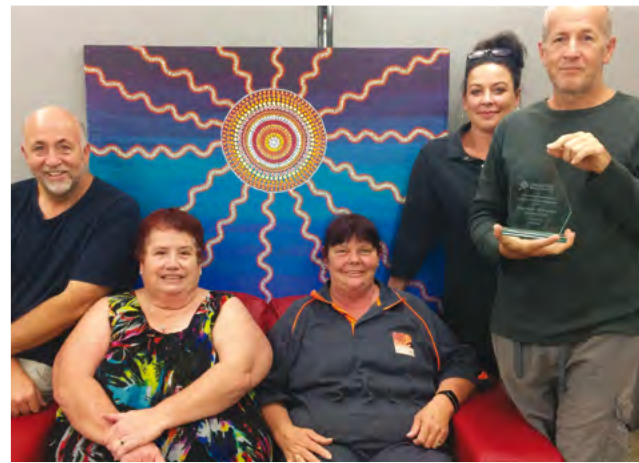
▲ Ungooroo's Board of Directors and Management.