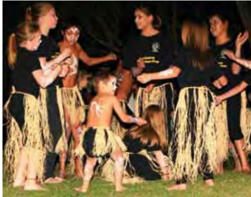
A big thanks to Port Stephen's Family Support Service and their dance group who performed on opening night.

If you would like further information about sales of artwork or commissioned artworks and upcoming events or sales on our t-shirts, caps and refreshment holders, please check out our website on www.ungooroo.com.au