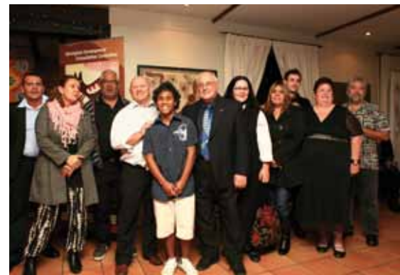
Artists represented in the WUPA 2011 Exhibition.