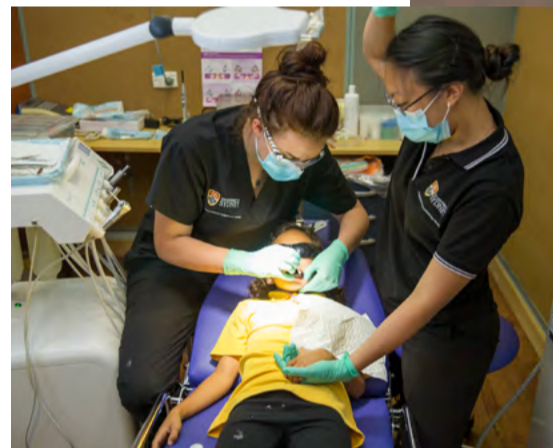
▲ Dental treatment